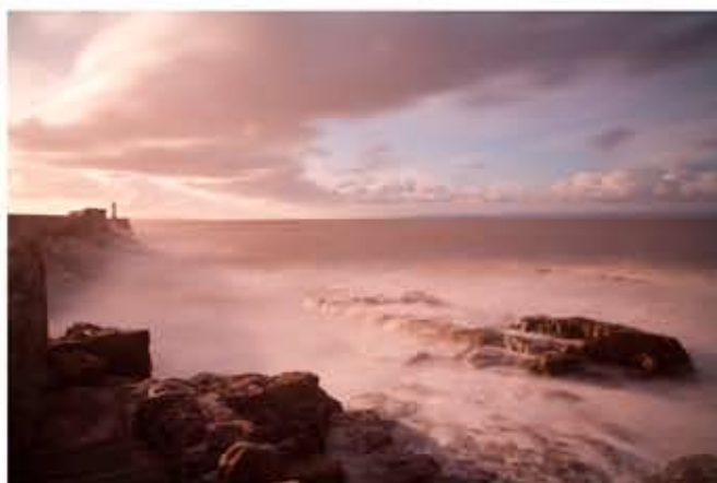
Long exposure using plastic ‘10 stop’ filter

These shots were taken on a storming morning at high tide. The image on the left shows the scene as it was seen. The long exposure on the right was taken using a plastic filter that was in effect made from the material used in Welding Goggles.