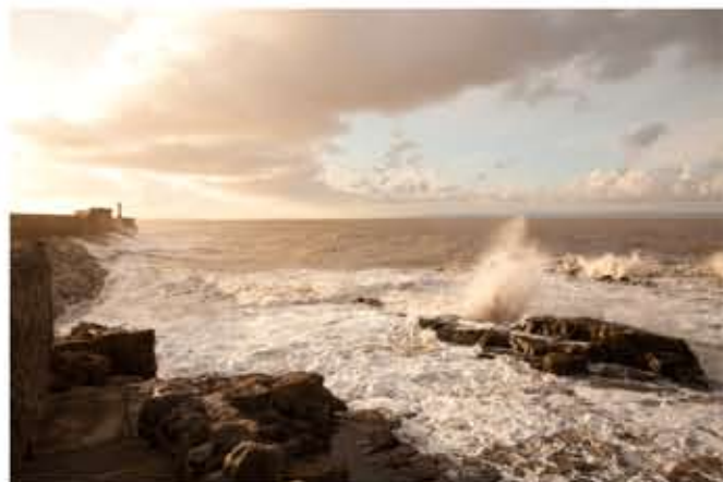
“Normal” exposure (1/30sec)

SUNRISE OVER PORTHCAWL: TAKEN ON 1st APRIL 2009 CANON 5D ISO 100, f18 27 secs