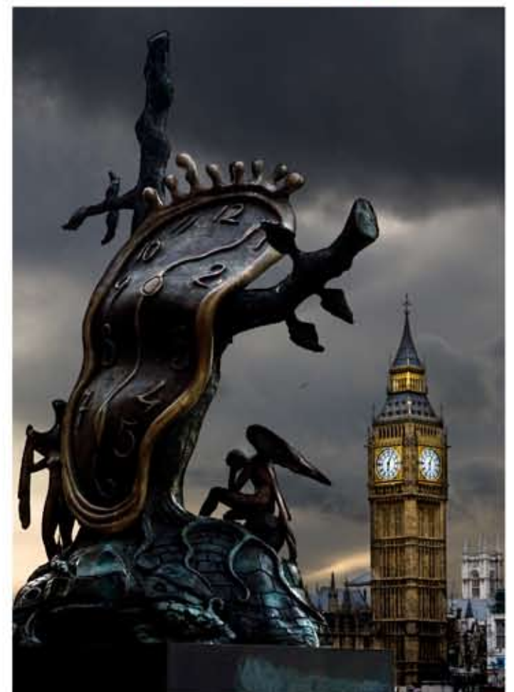
Final Image - 'Twisted Time'