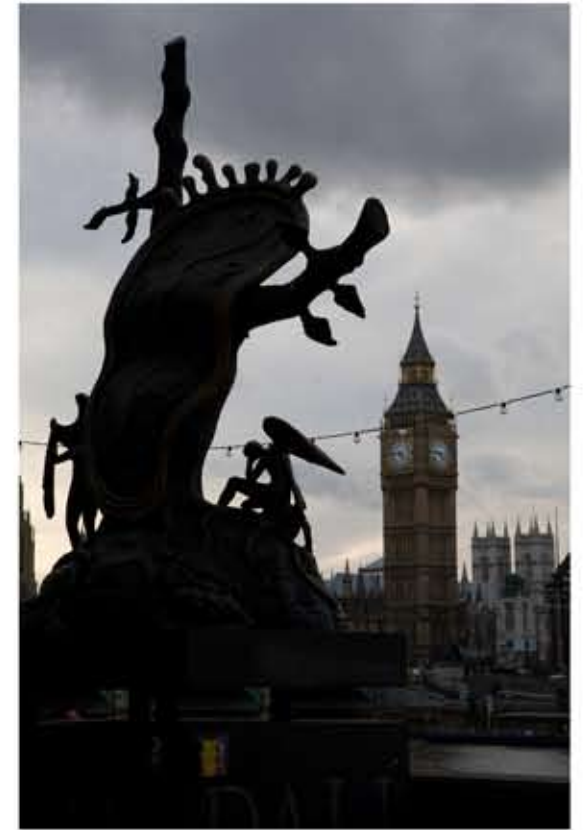
_MG_4896.CR2 1/80sec F10 ISO 200

Exposure Correction: 3 separate RAW conversions were created from the original _MG_4896.CR2 file;